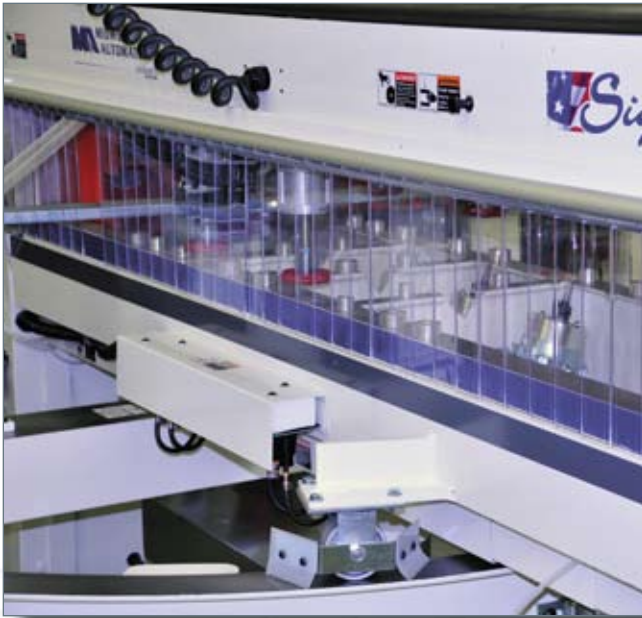
Side Shield in Down Position