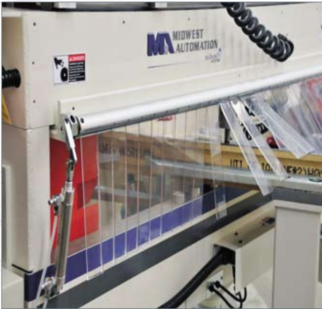
Side Shield from Rear of Machine with Countertop