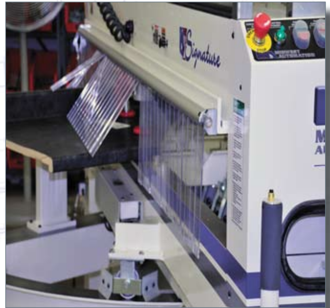
Side Shield from Front of Machine with Countertop