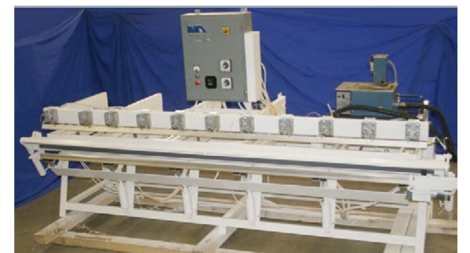
AC 3120 Autocove, S/N 147-8010

Includes new paint, infeed/outfeed roller conveyors, I/R heaters, hot air guns, outfeed trimmers, and slitter saw