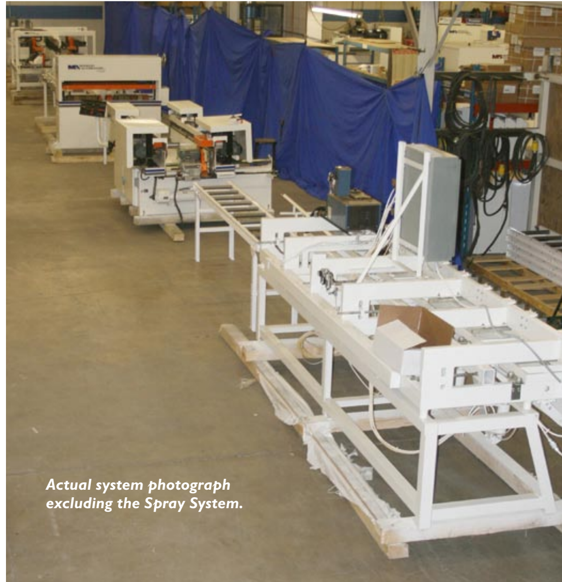
Actual system photograph excluding the Spray System.

Includes new paint, infeed roller conveyor, upgraded individual vacuum generators, and new large diameter suction cups