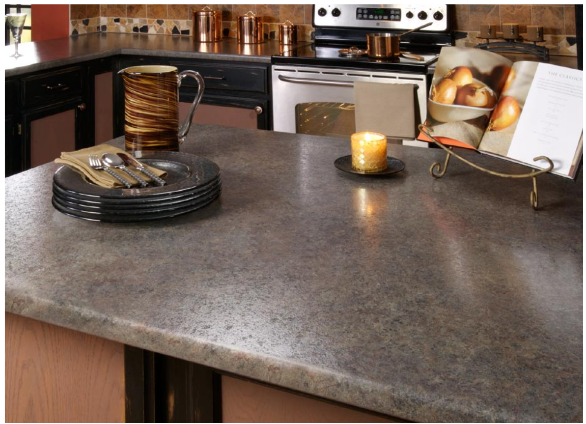
Photograph "Canyon Creek"

For over 50 years, Midwest Automation has designed, manufactured, installed and serviced kitchen countertop postforming and laminating systems around the world.