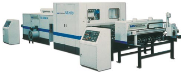
SS 2070 Spray System, S/N 165-9304

Includes panel cleaner, infeed/outfeed roller conveyors, belt conveyor and drying tunnel (not actual machine photograph)