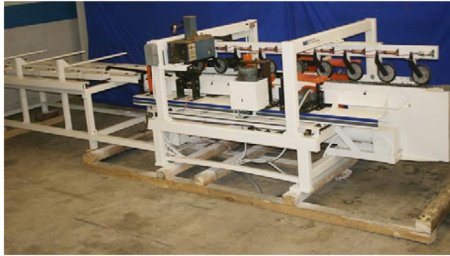
Corfab 1521, S/N 21-7609

Includes new paint, a rebuilt Nordson® hot melt unit, special infeed table, outfeed roller conveyor, and dust collector