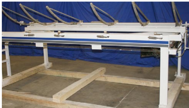
IX 2105 Index Table, S/N 190-9002

Includes panel cleaner, infeed/outfeed roller conveyors, belt conveyor and drying tunnel (not actual machine photograph)