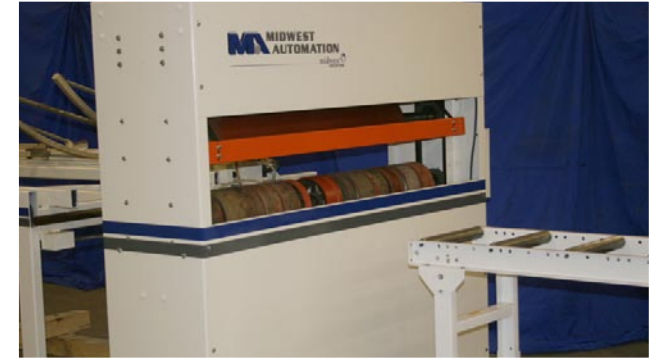
PR 2150 Pinch Roller, S/N 3217-8001

The system includes a combination of factory-reconditioned, factory-tested, and used machines to provide a complete turn-key system. The system is configured to produce standard postformed kitchen countertop, vanity, and bartop profiles at the rate of approximately one (1) per minute.