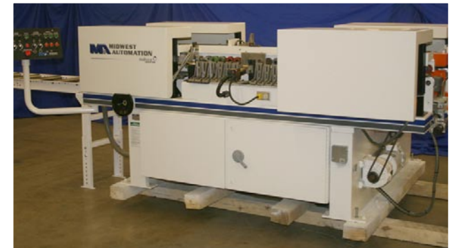
MF 118 Miniform Postformer, S/N 166-9006

Includes new paint and refurbished upper and lower segmented rollers